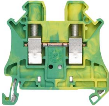
Terminal, screw terminal, PE/PEN terminal, 2.5 mm 2 , green-yellow