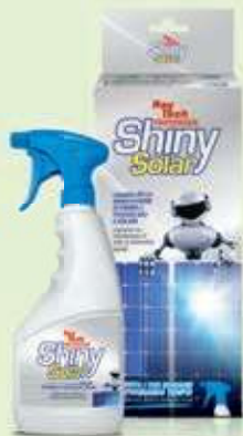
Shiny Solar Solution for solar and photovoltaic panel maintenance