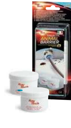
Galactic Animal Barrier Mouldable rubber paste to prevent animal intrusion