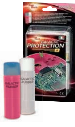
Galactic Protection Bicomponent rubber for printed circuit protection against animal intrusion