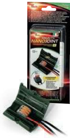
Galactic Nano Joint Straight and derived single pole joint complete with pre-filled gel snap connector