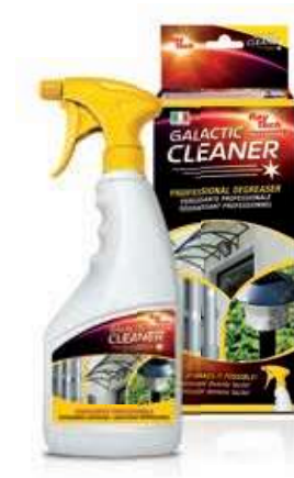
Galactic Cleaner Professional Extraordinary detergent for all types of use