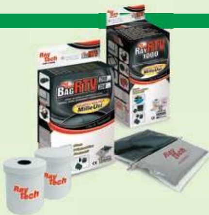
Ray RTV Fast cross linking bicomponent silicone rubber