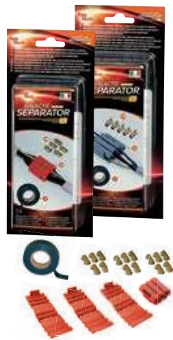
Galactic Separator Spacer and connector kit