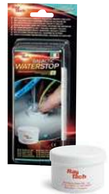
Galactic Water Stop Ready to use single component gel for generic use