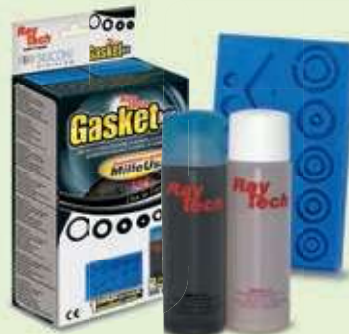
Gasket Kit Kit for the packaging of rubber profiles