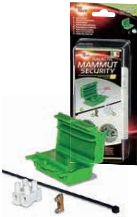
Galactic Mammut Security Straight joint pre-filled with gel

KITS FOR THE CONNECTION, MAINTENANCE AND PROTECTION OF ELECTRICAL SYSTEMS