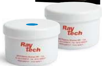
Kit composition: 2 cans (bicomponent)