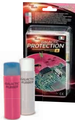
Galactic Protection Bicomponent rubber for printed circuit protection against animal intrusion