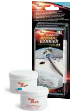
Galactic Animal Barrier Mouldable rubber paste to prevent animal intrusion