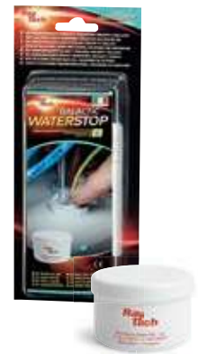
Galactic Water Stop Ready to use single component gel for generic use