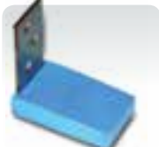
On-site preparation of braces and supports