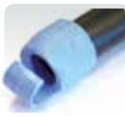
Preparation of deflectors, nozzles, flow deviators