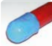
Cable head protection