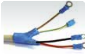
Creation of LV terminals