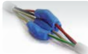
Insulation of multiple connections