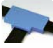
Drop line, bar, transformer through insulation