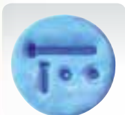
Preparation on-site of small moulds for reliefs