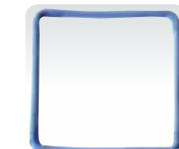
Preparation on-site of seals