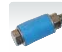
Preparation on-site of expanders for inserts