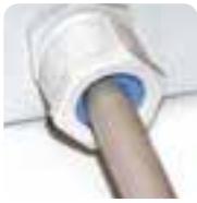
Cable gland sealing